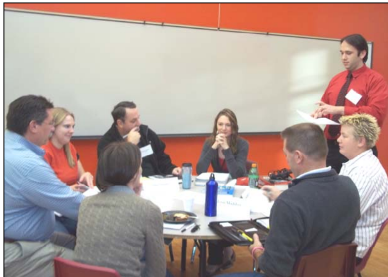
CCC teachers and construction industry representatives attend an Industry Mentor Meeting.

During the 2010-2011 school year, Construction Careers Center staff members and construction industry representatives began the collaborative CCC Industry Mentor Program. Through this program, CCC teachers and staff are matched up with leaders from the St. Louis area construction industry to form working partnerships that bring more construction related ideas and projects into CCC classrooms. Whether it is hearing from a guest speaker, attending a field trip, or calculating the amount of cubic yards of concrete needed for a project, students were given an opportunity to make real world connections with the academic courses at CCC. In addition to some of the exciting projects and field trips that were conducted this school year, plans are being made to expand the program next school year to include college and career planning. This is just one more way that CCC is working to build the next generation of construction industry leaders in St. Louis.